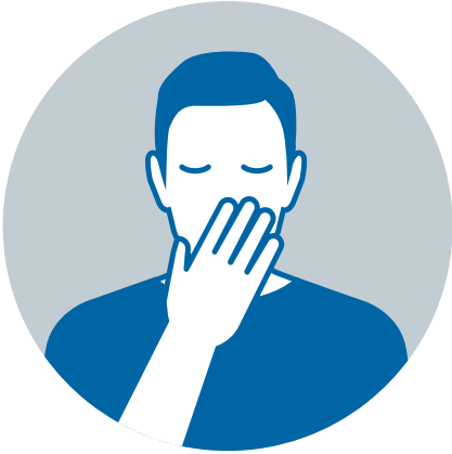
Avoid touching eyes, nose or mouth