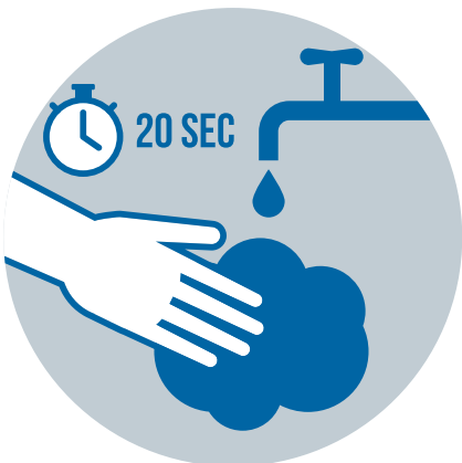
Wash hands often