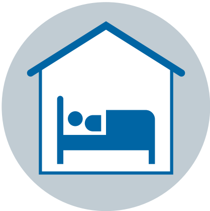
Stay home while you are sick; avoid others