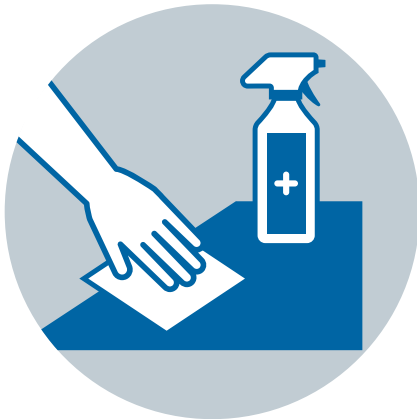
Clean and disinfect frequently touched objects and surfaces