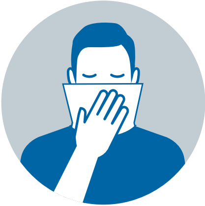
Cover mouth/nose with a tissue or sleeve when coughing or sneezing